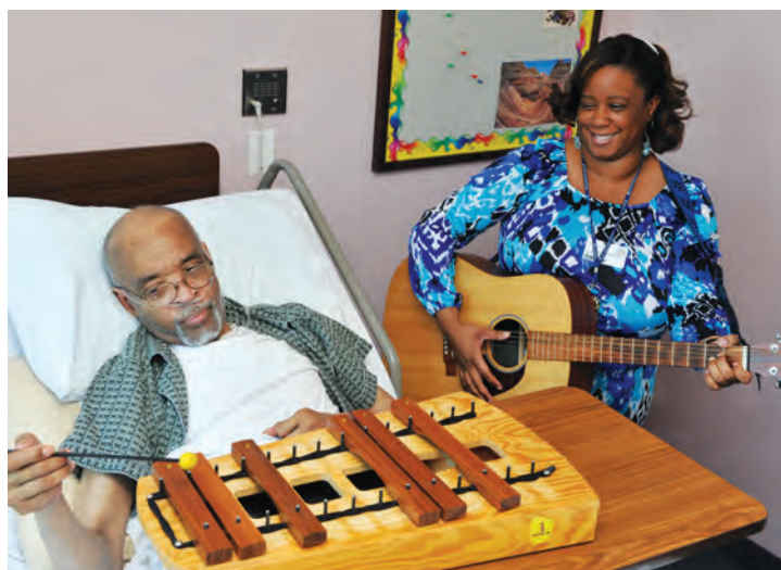
Music Therapists, Bringing Music to the Bed-side

We decided to fund a part-time music therapist for three years at Menorah to work with residents. Not only will the music therapist work directly with some of Menorah's most vulnerable residents...but the therapist will also educate staff, family members, and caregivers about the power of music therapy, documenting its effectiveness along the way.