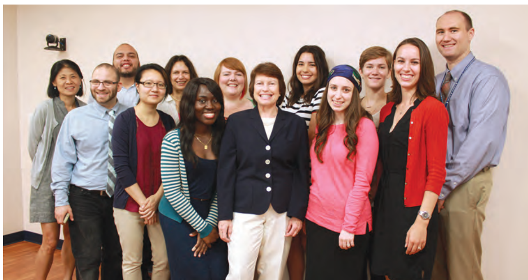
The Institute Team and The 2016 MJHS Fellows

M JHS understands the compelling need for more clinicians to be trained as palliative care specialists. That's why in 2015 the MJHS Institute for Innovation in Palliative Care, working in concert with MJHS Hospice and Palliative Care, launched the new Hospice and Palliative Medicine Fellowship Program for physicians and nurse practitioners.