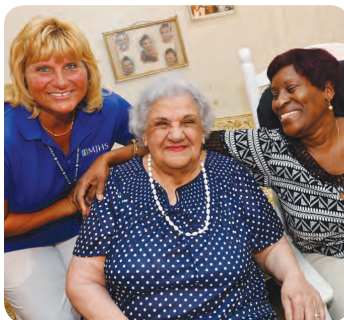
HHA Provides Patients Much Needed Support